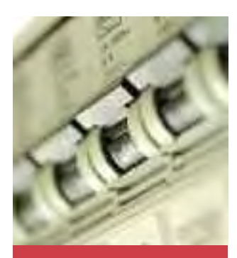
Consideration should be given to the installation of surge protection equipment.

Churches have always suffered from the effects of lightning. As well as lightning conductors, consideration should be given to the installation of surge protection equipment.