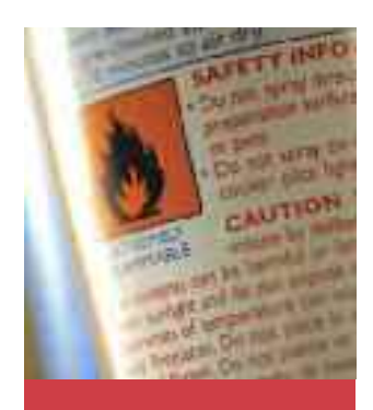
Smoking should be prohibited if possible and should never be permitted in the building or where flammable liquids or vapours are present.

There is a serious danger of fire or accident when works of repair or restoration are in progress and Managing Trustees should, in their own interest, exercise close supervision of all such works.