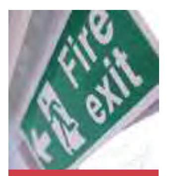
Protect people by providing fire precautions such as fire extinguishers, emergency escape routes and exits.

The Government is committed to reducing death, bodily injury and damage caused by fire. To implement this initiative the Regulatory Reform (Fire Safety) Order 2005 (RRO), which took effect from 1 October 2006, repealed and replaced over 100 pieces of previous fire safety law.