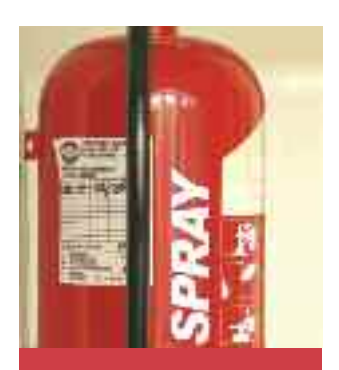
Fire extinguishers must always be readily available where candles are being used.

When using candles in church it is important to remember that they can be the cause of major fires and serious injuries if not used correctly. Simple precautions should mean that candles can be used safely.