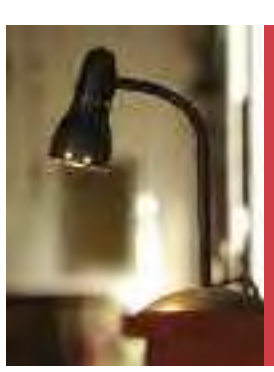
Electrical wiring in churches Many fires are caused by faulty wiring or appliances.

This advice is provided to you as best practice guidance from Methodist Insurance. Please check your policy documents for details of any conditions specific to your policy.