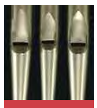
Most Managing Trustees are rightly aware that the organ presents a 'danger area' .

Despite increasingly high standards of installation, numerous church fires can be attributed to faulty electric wiring or apparatus. It is therefore important that electricity should be treated with respect.